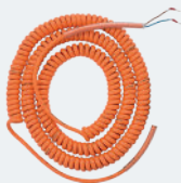
Coiled grounding cable up to 15 m