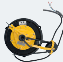
Cable reel up to 10 m