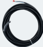
Straight grounding cable up to 30 m