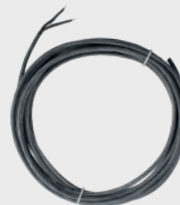
Low temperature grounding cable up to 30 m